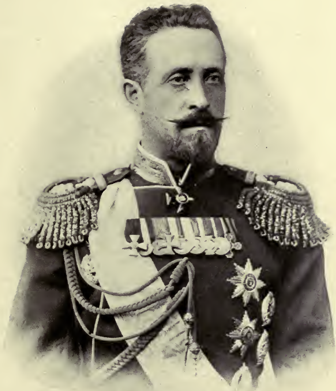
THE GRAND-DUKE NICHOLAS